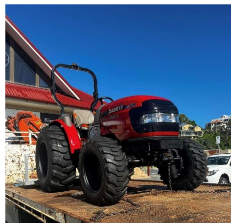
New Tractor Arrives