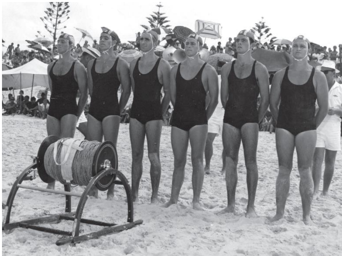
Point Danger Branch and Queensland R&R Champions 1965-66.