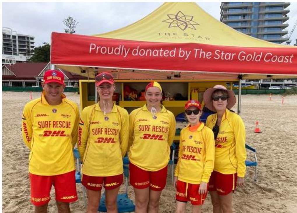
INTERNATIONAL WOMEN'S DAY PATROL