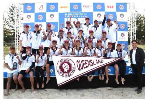
Qld Cyclone IRB Team