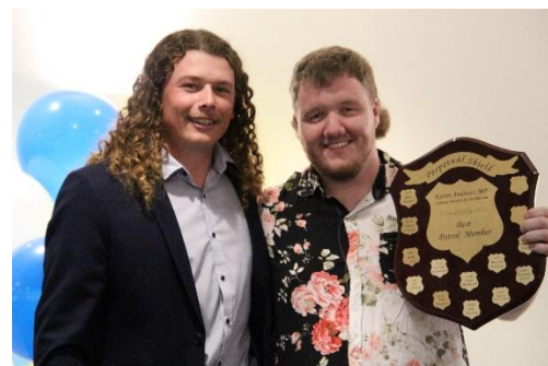
We celebrate our members