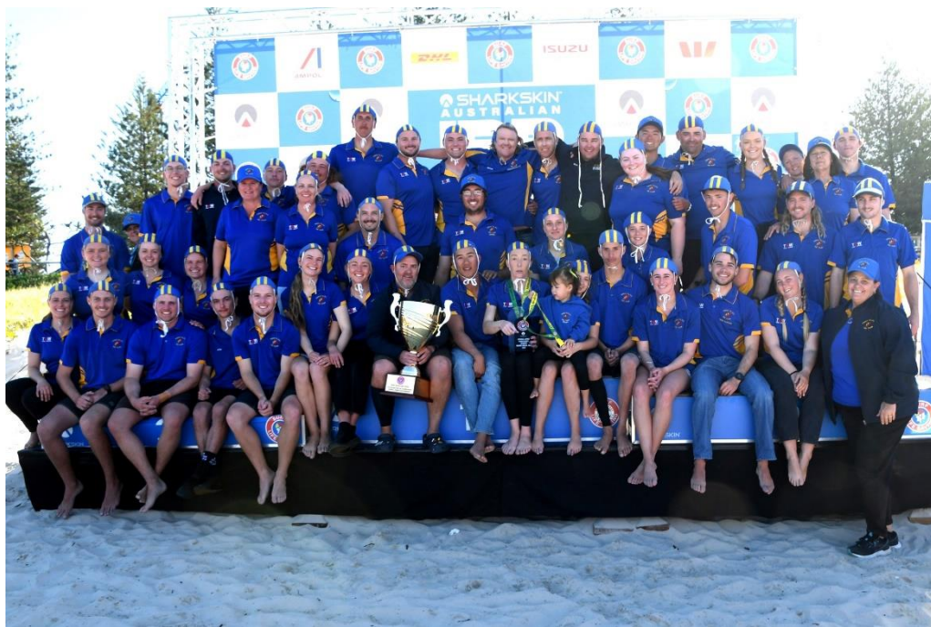
AUSTRALIAN OPEN IRB CHAMPIONSHIP 2024